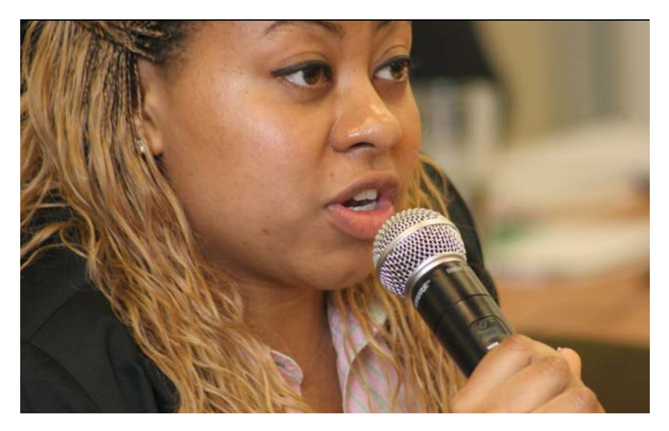
Connecting Black Males Work to Women's Empowerment By Shanell Williams

When you address black men and the issues they are struggling with, you are addressing the black family as a whole. We cannot deal with the issue of black men, black women and black children in silos.